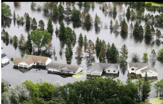
Minot, ND after flooding in June 2011.