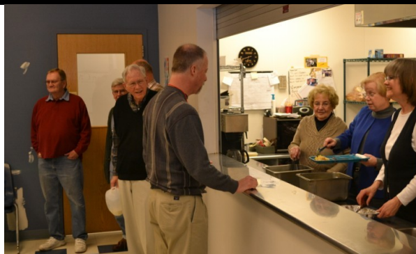
Hunger Team serves meals at Rescue Mission